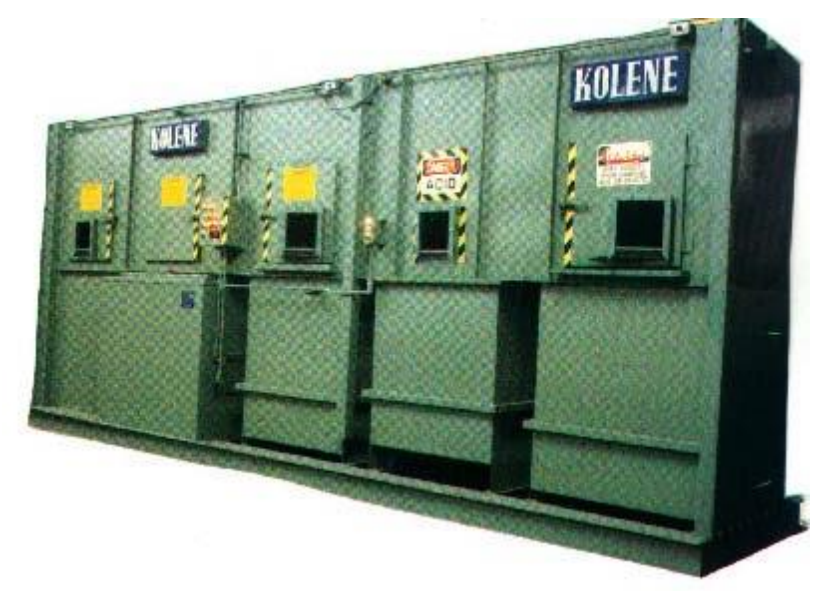
Figure (1) Typical Kolene® Unit

In general, salt bath furnaces are constructed of plain carbon steel, but may be constructed of stainless steel, Inconel, or other materials for specific processing requirements. Proper initial construction with double wall design and selection of materials assure long, safe, salt furnace performance. All units should be provided with exhaust ductwork and air washers or scrubbers.